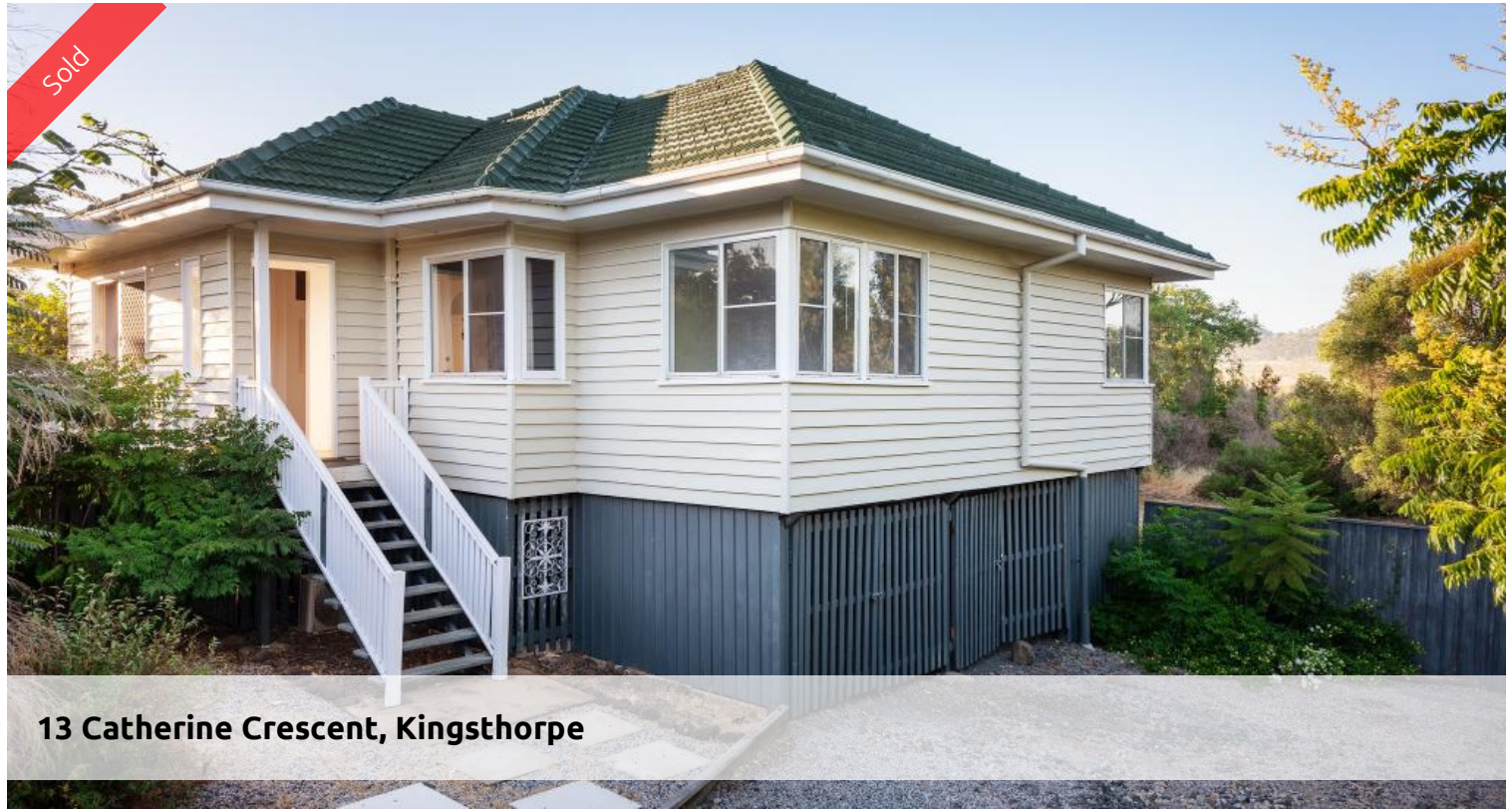
13 Catherine Crescent, Kingsthorpe