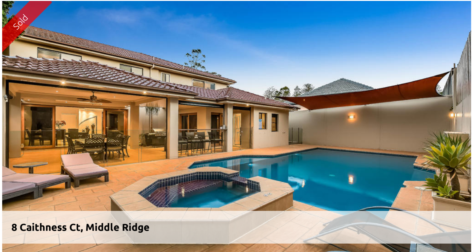
8 Caithness Ct, Middle Ridge