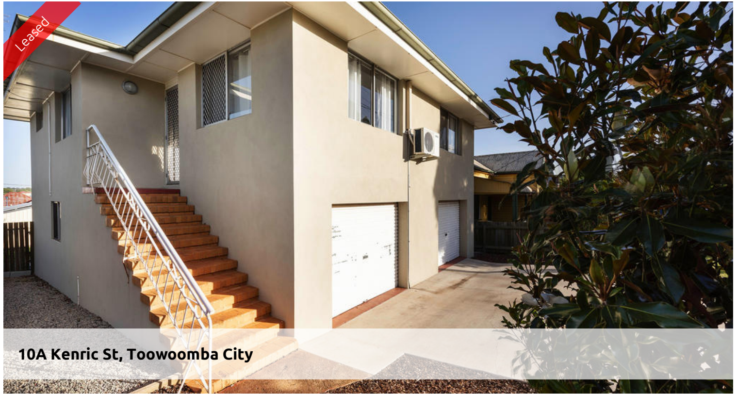
10A Kenric St, Toowoomba City