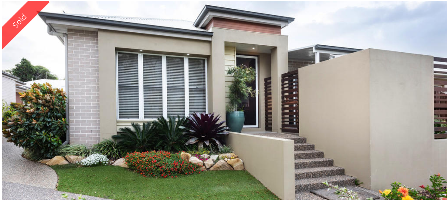
Unit 1, 21 Primrose St, South Toowoomba